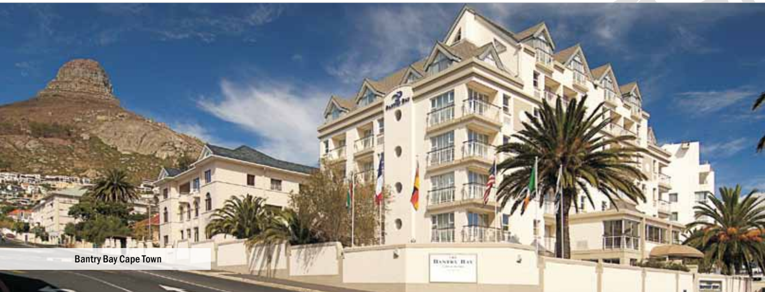
Bantry Bay Cape Town